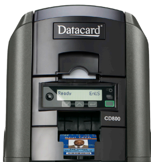
Datacard® CD800™ Series Card Printer