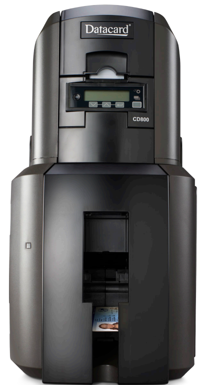
Datacard® CD800™ Card Printer with inline lamination module